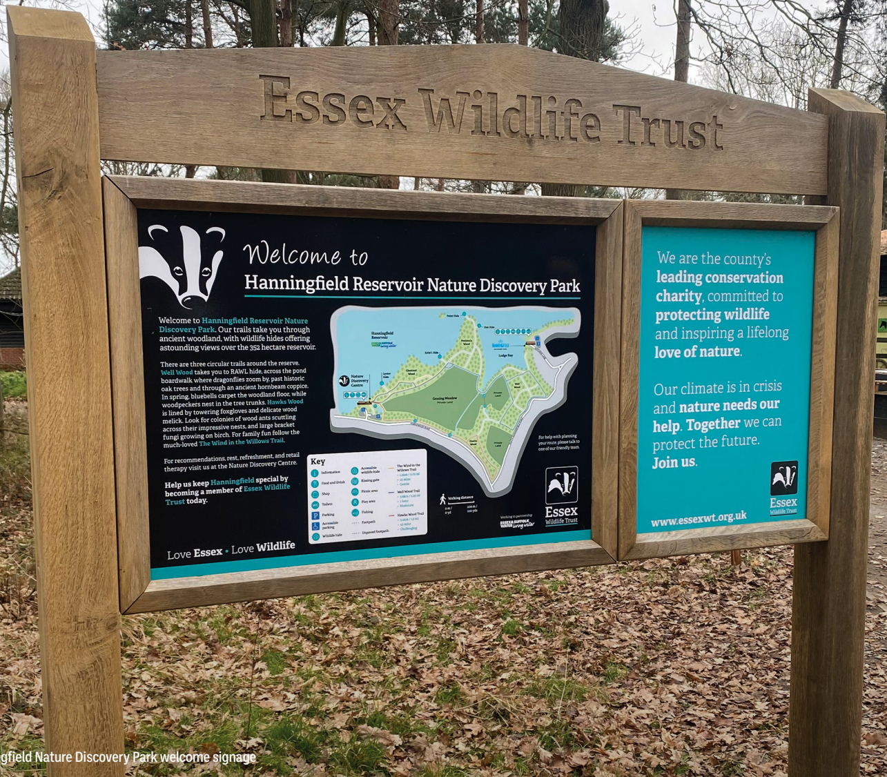
Hanningfield Nature Discovery Park welcome signage