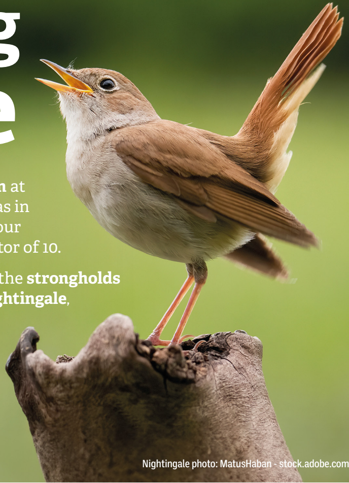
Nightingale photo: MatusHaban - stock.adobe.com

From reconnecting Essex's rivers to securing the strongholds for iconic species such as turtle dove and nightingale , the achievements we've highlighted in the following pages were above and beyond our 'business-as-usual' management of over a hundred sites across the county for the benefit of people and wildlife, covering 3,030 hectares of land and approximately 200 km of watercourses.