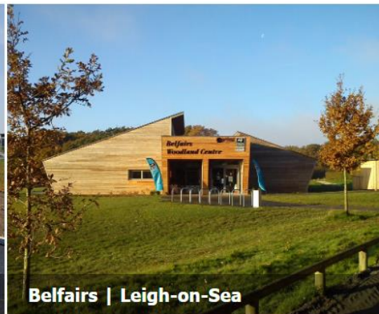
Belfairs | Leigh-on-Sea