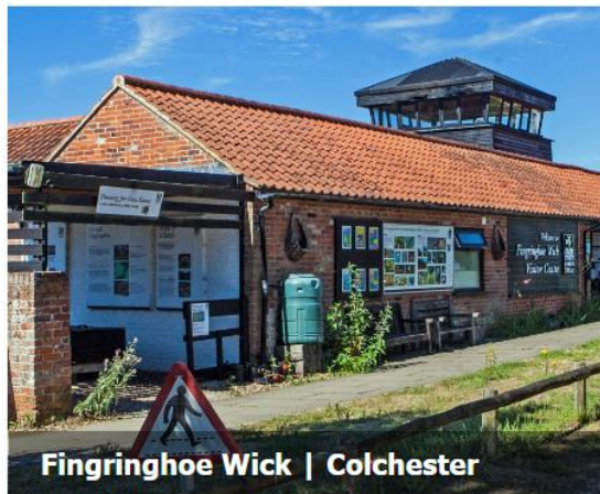
Fingringhoe Wick | Colchester