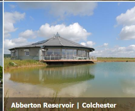
Abberton Reservoir | Colchester