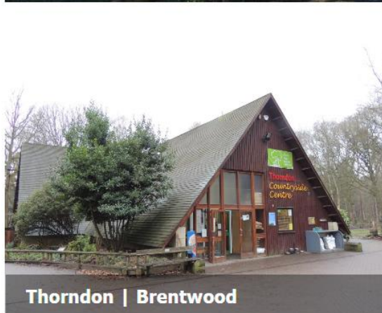
Thorndon | Brentwood