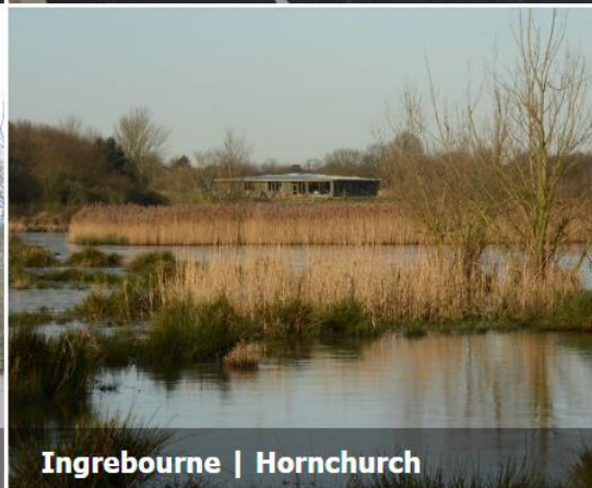
Ingrebourne | Hornchurch