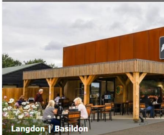
Langdon | Basildon