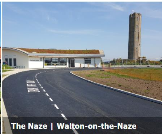
The Naze | Walton-on-the-Naze