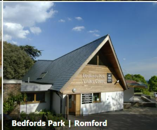
Bedfords Park | Romford