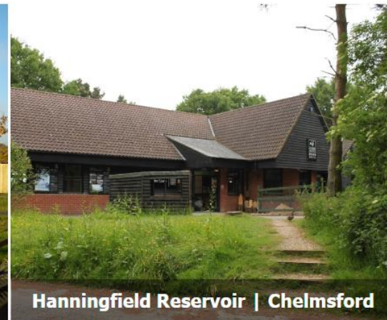
Hanningfield Reservoir | Chelmsford